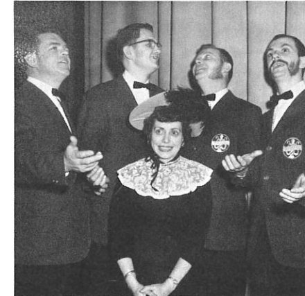
"THE MUSIC MAN"