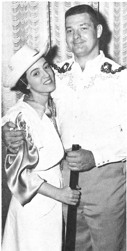
"ANNIE GET YOUR GUN"