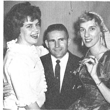
"THE DESERT SONG"