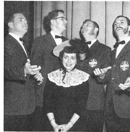
"THE MUSIC MAN"