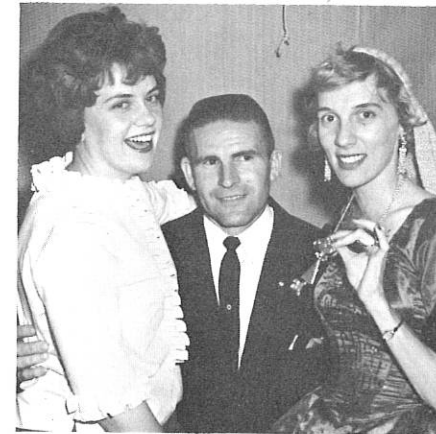
"THE DESERT SONG"