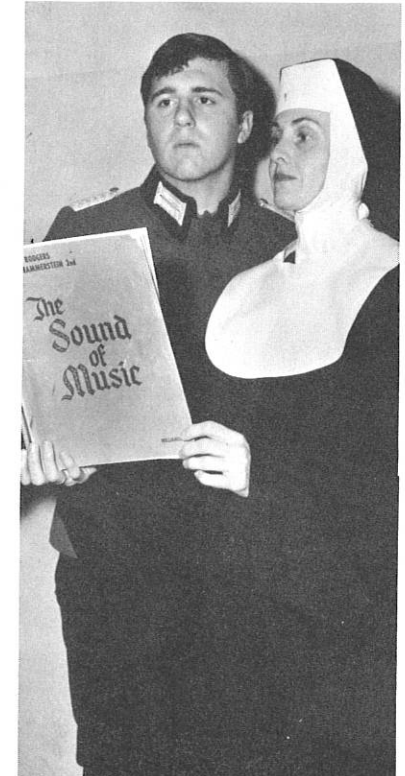
"THE SOUND OF MUSIC"