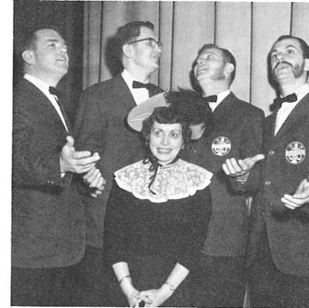
"THE MUSIC MAN"