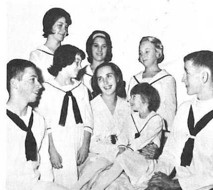
"THE SOUND OF MUSIC"